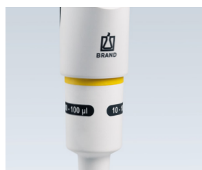
Integrated shaft coupling