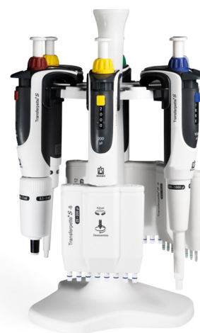
Bench top rack for 6 Transferpette® S single- or multi-channel pipettes.