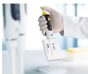
Working with PCR plates