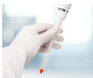
Narrow centrifuge tubes

Individual nose cones and seals can be easily removed for cleaning or replacement