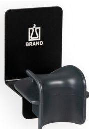
Wall mount for 1 Transferpette® S single- or multi-channel pipette.