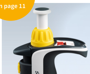
Easy Calibration technology