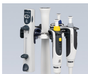
The rack mount also fits the Transferpette® S bench-top rack.