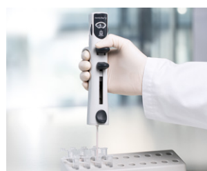
Dispensing small volumes