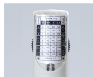
Fast volume selection with the volume table on the back side