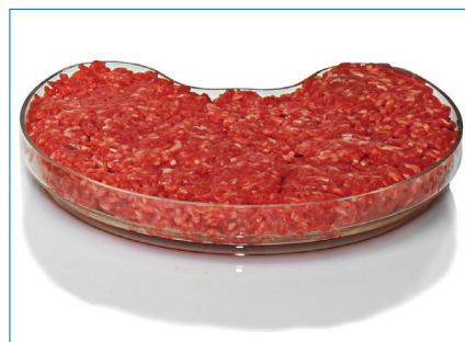
1. Prepare sample in dish

The DA 6200 is designed using NIR transmittance technology, allowing you to analyze large representative sample volumes in one measurement. Light is transmitted through the samples and collected with diode-array detectors. NIR calibrations have been collected in collaboration with multiple meat processors, institutes, and universities and are based on a wide range of beef, pork, poultry, and raw-meat products. And because it's equipped with ready-to-use global artificial neural networks (ANN) and partial least squares (PLS) calibrations, the DA 6200 is a plug-and-play solution.