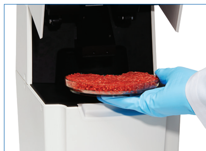
2. Analyze sample