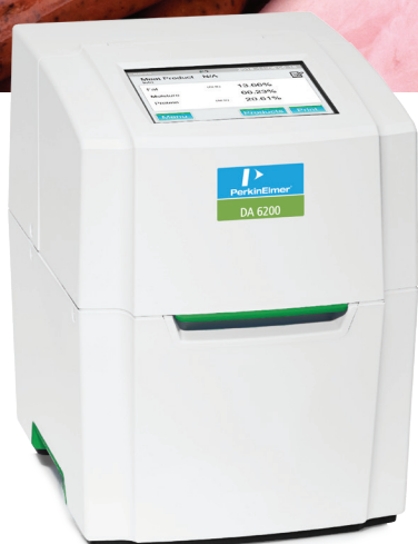
DA 6200™ Portable NIR Meat Analyzer