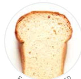
Falling Number 250