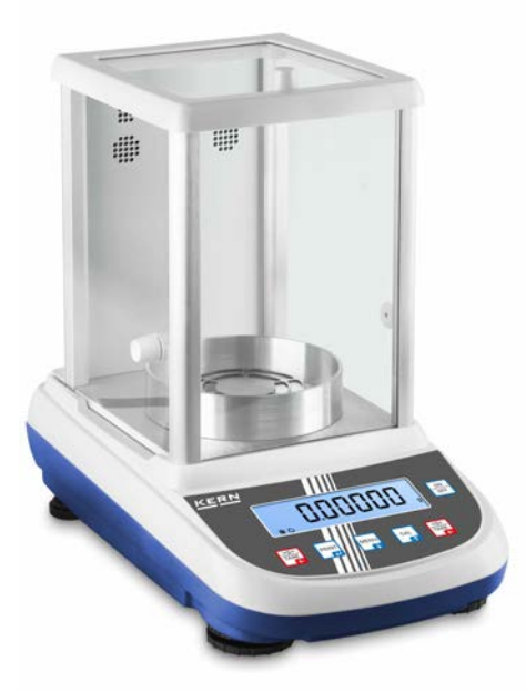
■ KERN ALJ 200-5DA with optional ionisor ②, see Accessories