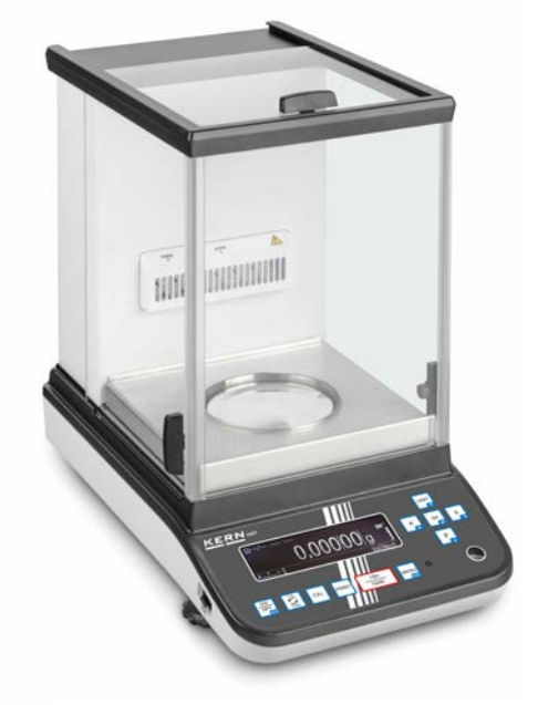
III KERN ABP 100-5DM with optional ionizer

■ NEW: Extremely fast ionization process, thanks to the latest generation of KERN ionization technology to neutralise electrostatic charge for fixed installation in the analytical balance. Particularly convenient handling as you no longer need a separate device. Simply enable the ionizer fan at the push of a button. Suitable for all models