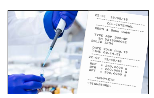
GLP/ISO record keeping professional and detailed GLP protocol, so that the scale is fully compliant with the relevant standard requirements according to ISO, GLP and GMP