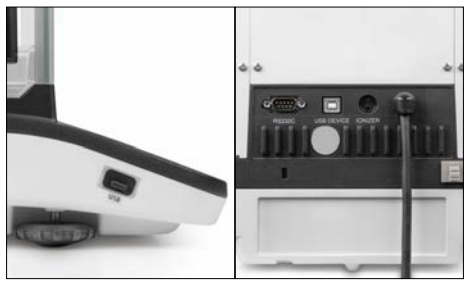
USB data interfaces and RS-232 for transferring weighing data to the PC, tablet, printer, USB as well as connecting external devices, such as barcode scanner (option), numeric keypad (option) etc.