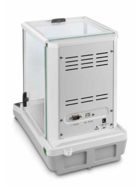
KERN ACS/ACJ with standard data interface RS-232 and USB

The bestseller in analytical balances, with high-quality single-cell weighing system, also with EC type approval [M]