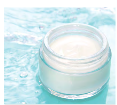
Organic nitrogen, ammonia, urea, formaldehyde, sulfated ash