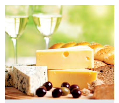
Protein, Non-Protein Nitrogen (NPN), casein (NCN), Total Volatile Basic Nitrogen (TVBN), sulfur dioxide (SO<sub>2</sub>), hydroxyproline, formaldehyde, ash