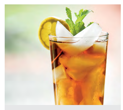
Protein, alcohol, volatile acids, diacetyl, sulfur dioxide (SO<sub>2</sub>)