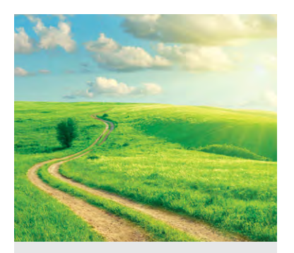
Ammonia, Total Kjeldahl Nitrogen (TKN), phenol, formaldehyde, phosphate, Chemical Oxygen Demand (COD), nitrate, nitrite (Devarda), heavy metals, (sulfated) ash