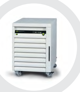
Linked external titrators