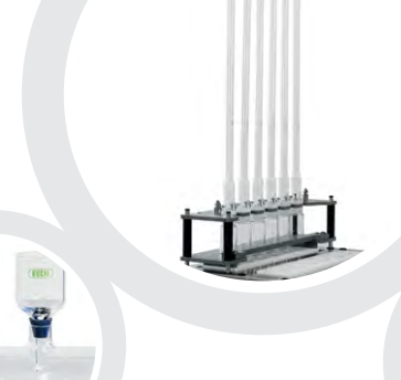
Optional H<sub>2</sub>O<sub>2</sub> digestion